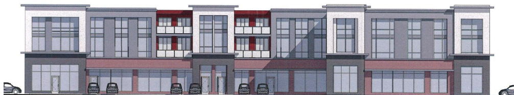
West Elevation - Along Argyle Street

New mixed use plaza development recently completed. Located at the corner of Argyle Street North and Orkney Street East, this new 3-storey retail/office and residential development features fully air conditioned, storefront units with good natural light, exterior signage and good parking. Superb visual exposure on the main traffic artery into Caledonia, just west of the new 3,500 home development by Empire Homes, currently underway. Ideal opportunity for most retail/office uses.